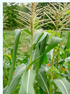
Corn and Scarlet Runner Beans in Wintergreen's Three Sisters Garden

afternoon and evening, featuring local foods and wines, live music by musicians in our area, and a silent auction – and perhaps a rollicking